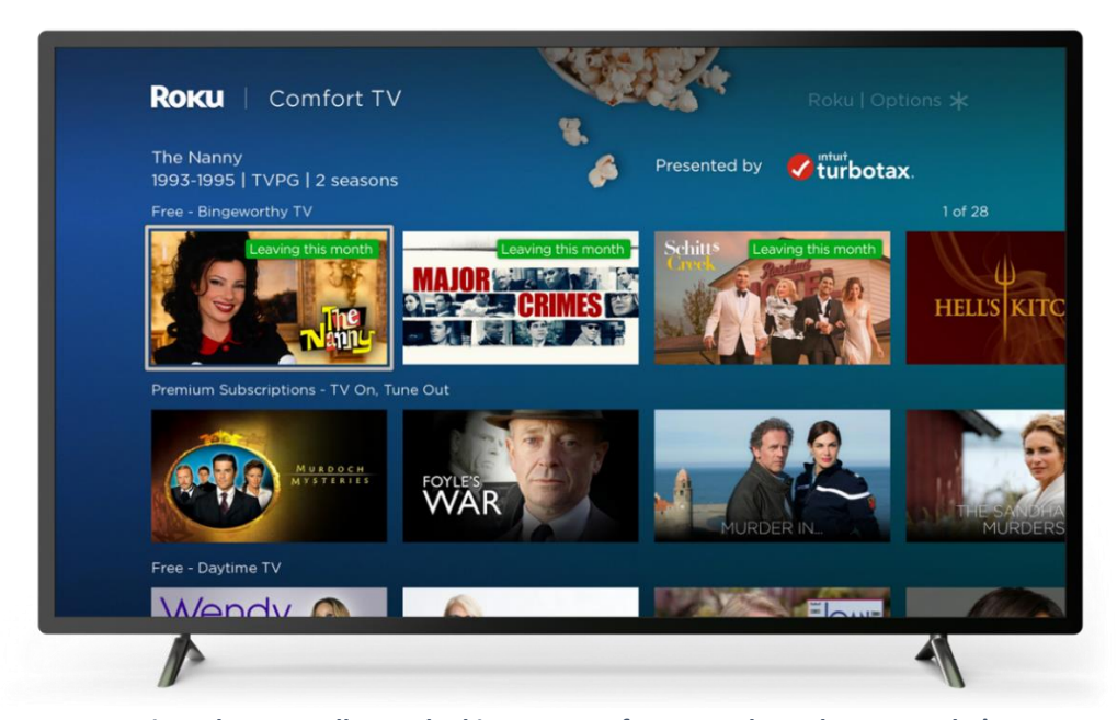
Intuit TurboTax reallocated ad investment from March Madness to Roku's "Home Together" Essential Movies and TV hub.