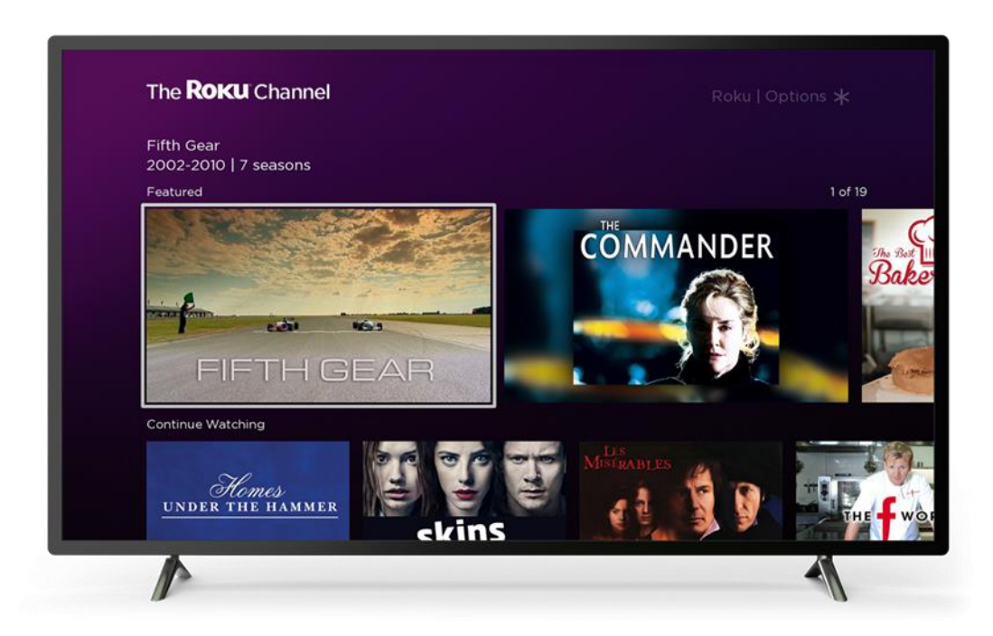
The Roku Channel in the UK makes it easy for Roku, NOW TV and Sky Q device owners to find great free entertainment.