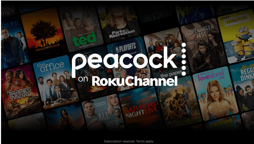
In April, we launched Peacock within Premium Subscriptions on The Roku Channel.

Channel, enabling them to enjoy a broad variety of great entertainment in a single app. We see a large opportunity to continue growing Premium Subscriptions, as the experience provides ease and value for both our viewers and our content partners. In the broader SVOD category, which includes Premium Subscriptions and direct-to-consumer app services, Roku was the fastest-growing distributor of third-party billed subscriptions 5 .